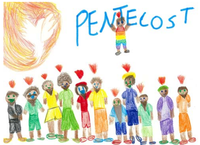
Artist Reece Greco