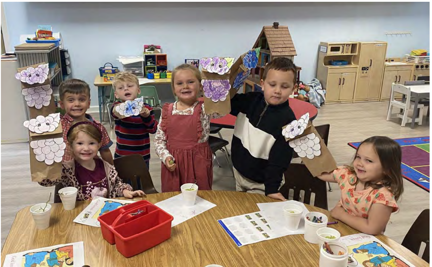
Our Redeemer's Preschool GIG class made puppets that can tell the vineyard parables.